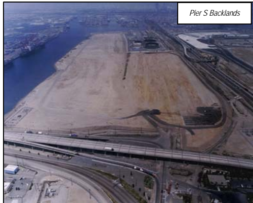
Pier S Backlands