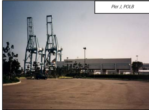
Pier J, POLB