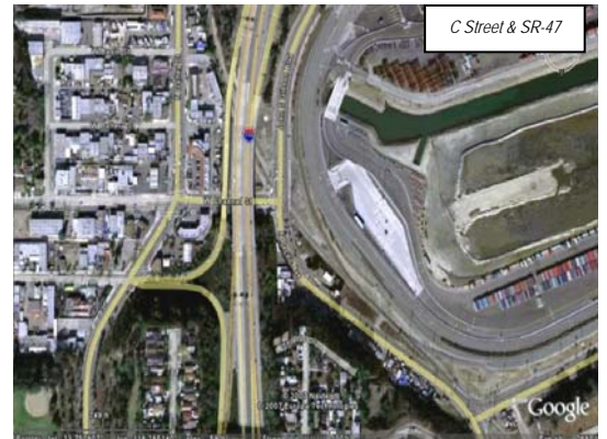
C Street & SR-47