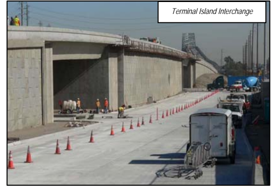
Terminal Island Interchange