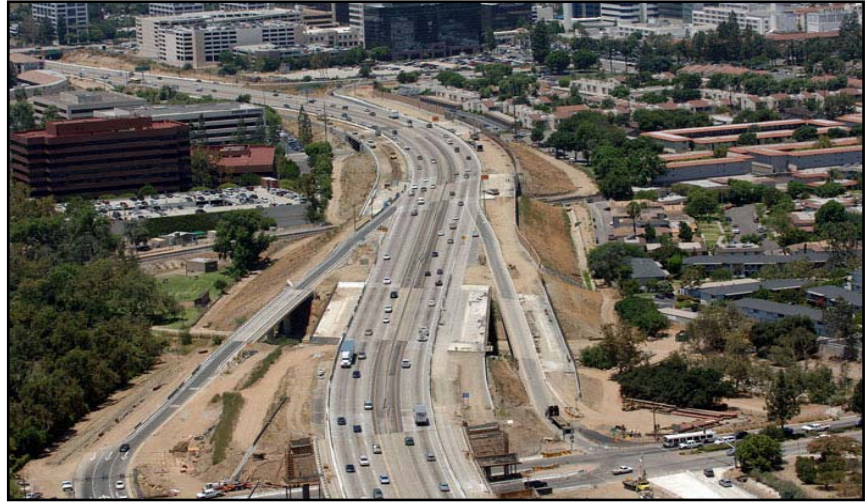
2006 ASCE Project of the Year

OCTA and Caltrans proposed to construct improvements for the SR-22 freeway in Orange County consisting of widening the freeway and construction of HOV lanes.